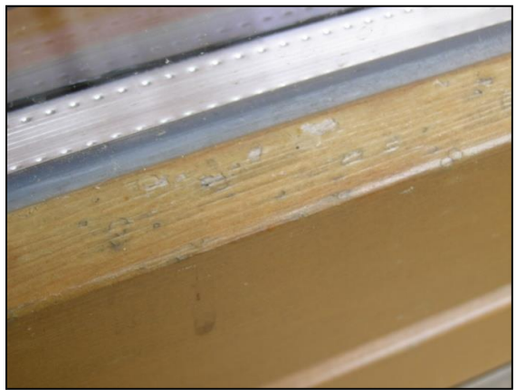
Fig. 3.1: Hail damage to the window

Regular visual inspection of the coating by the end customer is important. At least once a year windows must be checked on mechanical damage to the coating. Through quick and easy repair of minor mechanical damage caused during the construction phase or by hail (Fehler! Verweisquelle konnte nicht gefunden werden.), extensive late damage can be easily prevented. It is absolutely necessary that manufacturers of the windows or front doors inform their customers of this.