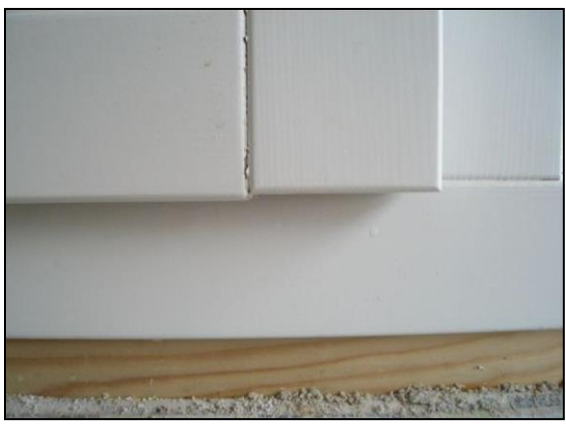
Fig. 3.3: Opened V-joint

Extreme change of humidity causes intense swelling and contraction. Such dimensional changes can lead to open V-joints. If joints open up, they must be sealed with ADLER V-Fugensiegel.