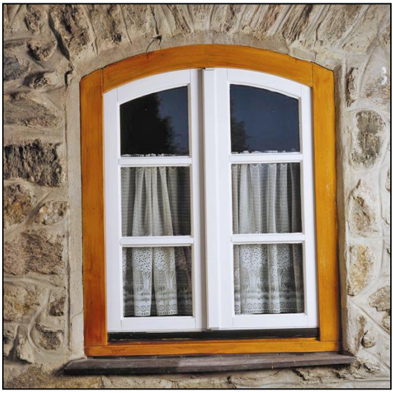
Fig. 4.3: After renovation coating