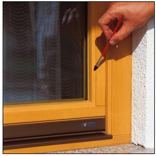
Fig. 4.1: Repair of damage