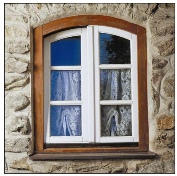
Fig. 4.2: Before renovation coating

In the case of severely damaged windows, the renovation is carried out with the solvent-based renovation system consisting of Pullex Renovier-Grund and Pullex Color.